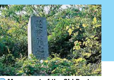
⑦ Monument of the Old Poet Basho There is the monument of Haiku poem by Basho Matsuo.