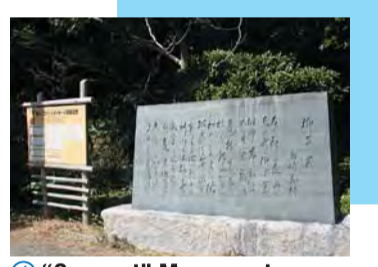
④ "Coconut" Monument A monument commemorating the birth of a folksong "Coconut", written by Tosen Shimazaki, a poet.