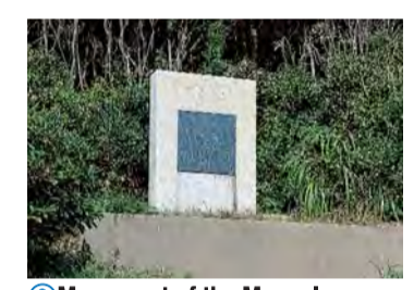
② Monument of the Manyo's poem A monument inscribed with a piece of Manyo's poetry by Omno-oki, an aristocrat of Tenmu Dynasty.